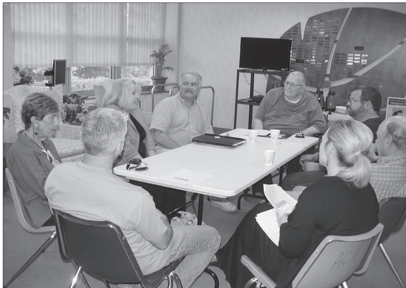
THE ANDERSON COUNTY REVIEW 05-21-2013