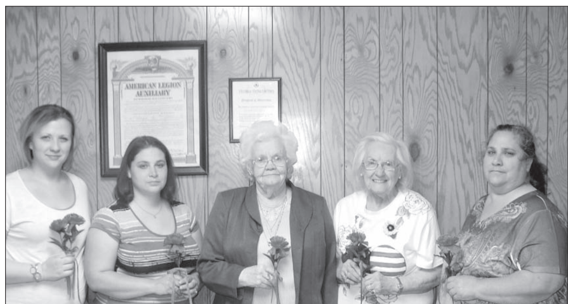
THE ANDERSON COUNTY REVIEW 05-21-2013