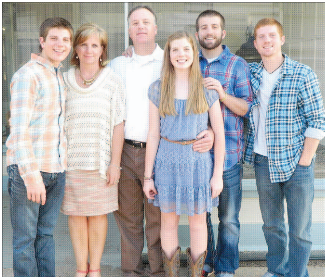
THE ANDERSON COUNTY REVIEW 06-29-2010