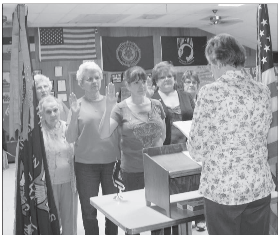
THE ANDERSON COUNTY REVIEW 05-21-2013