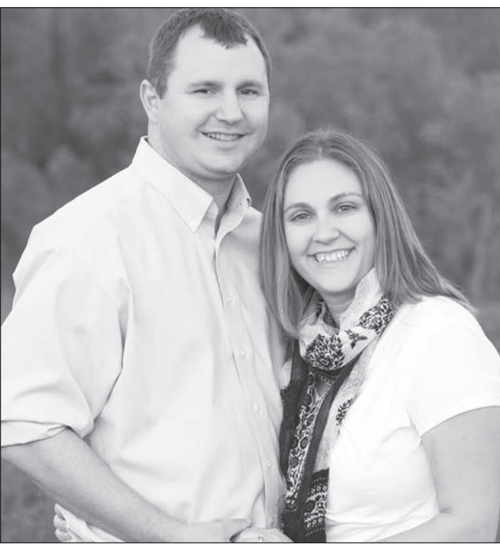
THE ANDERSON COUNTY REVIEW 05-28-2013