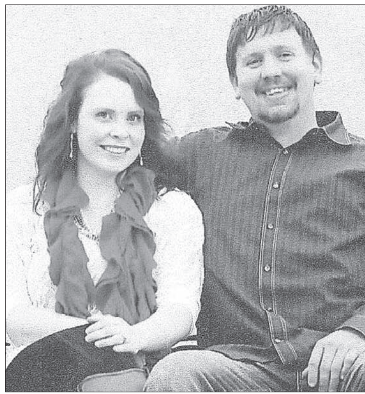
THE ANDERSON COUNTY REVIEW 05-28-2013